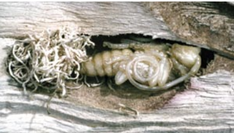
Asian longhorned beetle pupa.

The Asian longhorned beetle larvae bore deep into healthy deciduous hardwood trees such as maple, boxelder, birch, horse chestnut, poplar, willow, elm, hackberry, sycamore, mimosa, and ash, eventually killing them. The impact on many of California's native hardwood species is currently unknown. Round exit holes, approximately 3/8 of an inch in diameter, located on trunks and branches, egg laying sites, frass at the base of