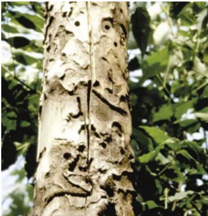
Young Norway maple tree damaged by larvae of the Asian longhorned beetle.

Asian longhorned beetle is not currently established in the western region of the United States, and the only acceptable approach to control is eradication. Early detection and reporting will help agencies to eradicate the pest and prevent its establishment.