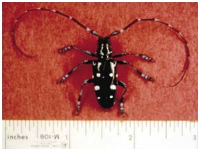
Dennis Haugen, USDA, Forest Service

The shiny black, bullet-shaped adult is about 1 to 1.5 inches long with irregular sized and shaped white spots. Its black-and-white banded antennae are usually longer than its body. The elongated feet are black with a whitish-blue upper surface. Adults can be seen from late spring through fall depending on climate and geographical location. Although its size and large mandibles may cause it